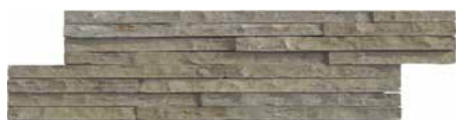
ST61WB 15x55 M002

WALL 5,9" x 21,6" REVESTIMIENTO 15 x 55 cm