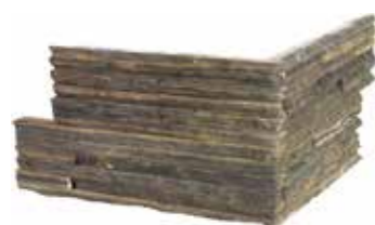
CANTONERA ST61WB 15x37* / 15x23* M004