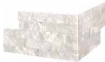
CANTONERA ST40W 15x37* / 15x23* M004