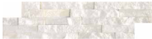
ST40W 15x55 M002

WALL 5,9" x 21,6" REVESTIMIENTO 15 x 55 cm