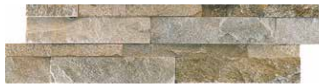
ST310 15x60 M041

WALL 5,9" x 23,6" REVESTIMIENTO 15 x 60 cm