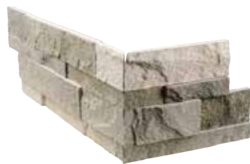
CANTONERA ST310 15x39* / 15x26* M020